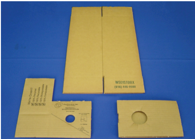
1 x 750ml WineShield™